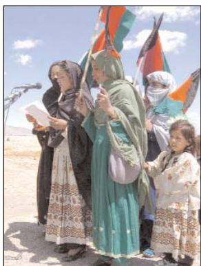
New school opens in Paktia province Page 7