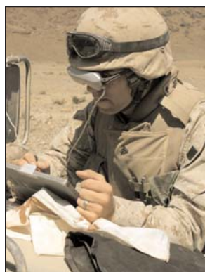
Marines get new look at insurgents Page 8