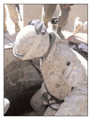
Marines step up raids in Kunar Page 3