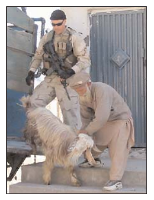
A-Bad PRT donates goats to village Page 4