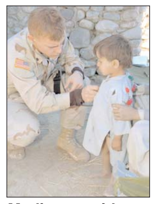
Medics provide aid to village Page 9