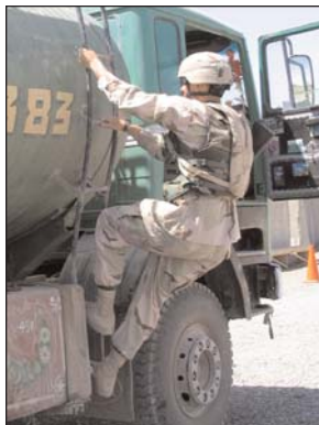
69th Trans. Co. hits the road Page 10