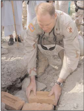
Khost PRT helps rebuild mosque Page 4