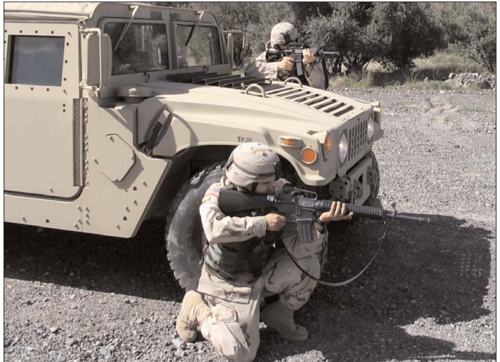
Soldiers from the 69th Transportation Company take part in convoy training soon after arriving at Forward Operating Base Salerno, Afghanistan.

Home is delivered mail, a topped-off generator, a vehicle search that discovered a potential threat to the FOB, or another squad of troops transported safely to their objective.