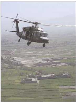
Blue Stars patrol skies over Khost Page 7