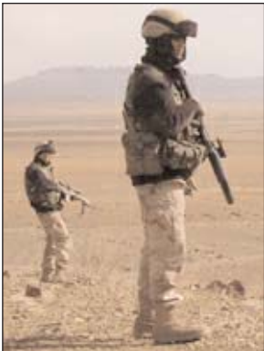
Wolfhounds patrol Waza Khwa area Page 3