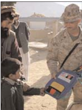
Marines deliver school supplies Page 6