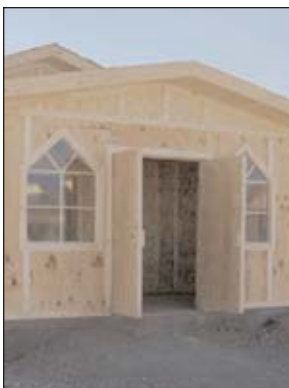
New chapel opens at FOB Salerno Page 7