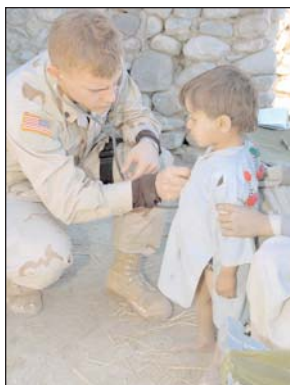
Medics provide aid to village Page 9