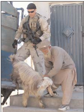
A-Bad PRT donates goats to village Page 4