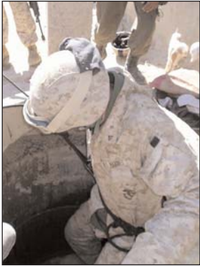
Marines step up raids in Kunar Page 3