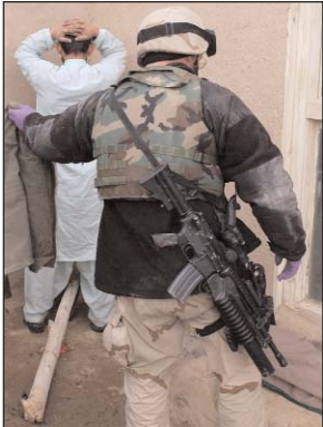
3-116 Inf. uncovers weapons in raid Page 3