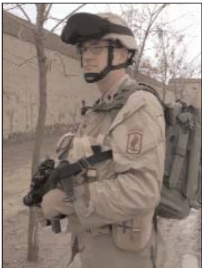
1-508 Inf. arrives in Paktika province Page 5