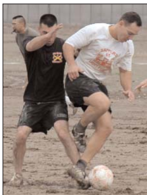
Salerno Day full of fun and games Page 8